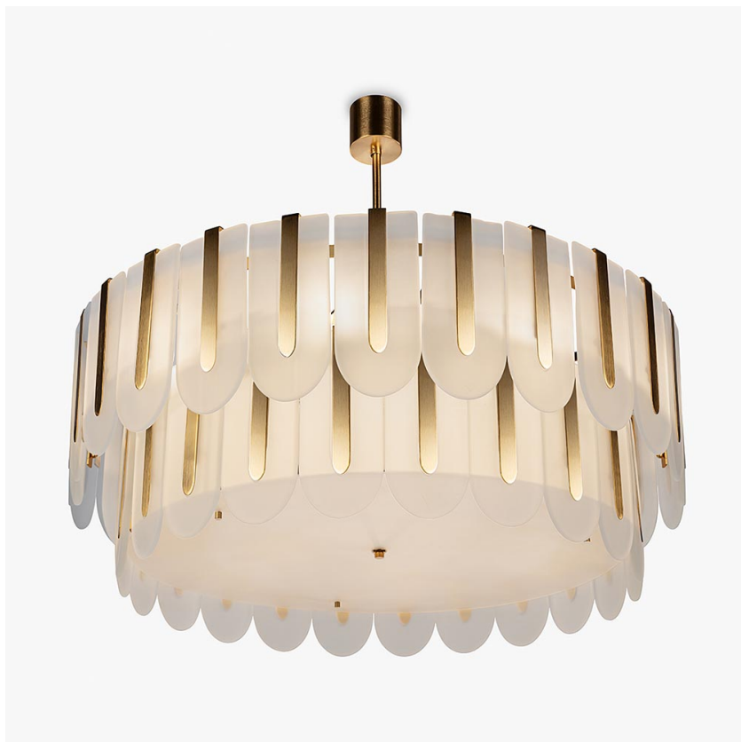
CL205 in Satin Glass and Brushed Gold