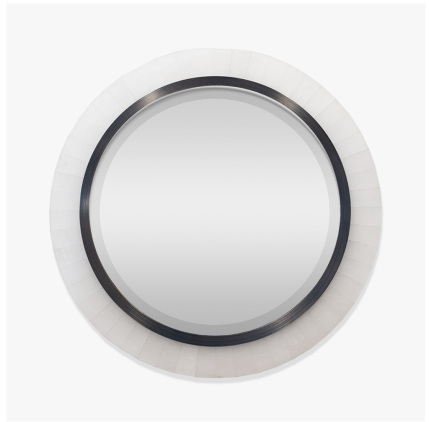
Dover Street Mirror in Brushed Bronze and Clear Hand-carved Lucite

Framed by distressed Lucite tiles, this design challenges our preconceived ideas of traditionalism. This piece modernises a room and creates a tranquil atmosphere throughout any space.