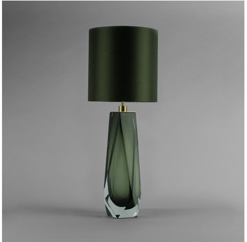
TL703-XL in Forest Green & Clear and Brushed Gold with 13" Tall Drum in Bennett's 1806W-120 Dill