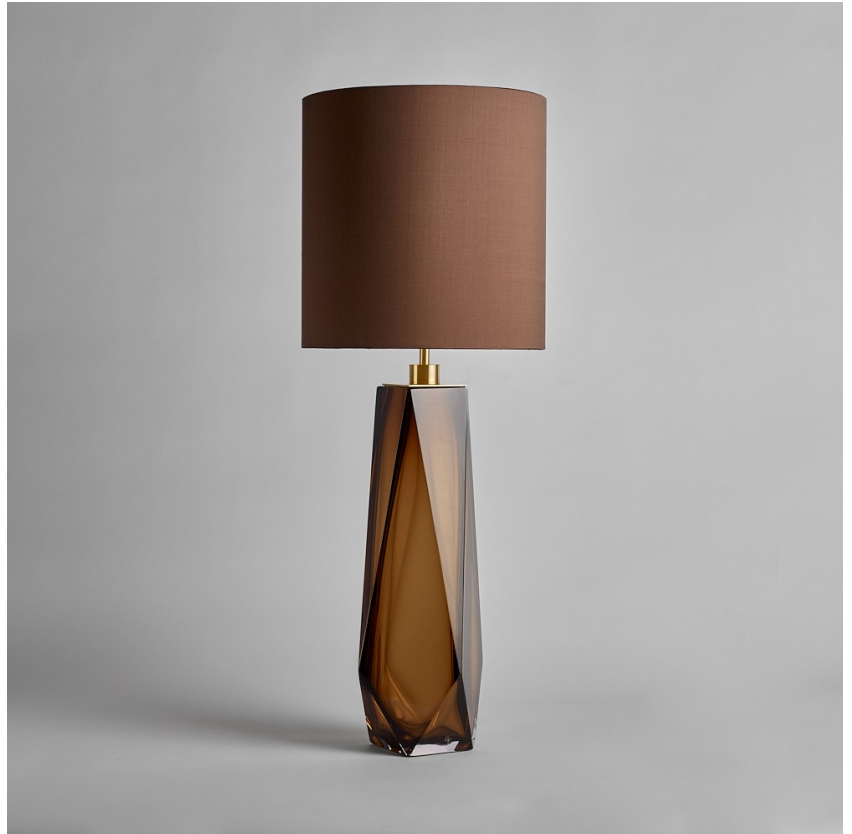
TL703-XL in Tobacco & Clear and Brushed Gold with 13" Tall Drum in Bennett's 5018W-126 Acacia Bark