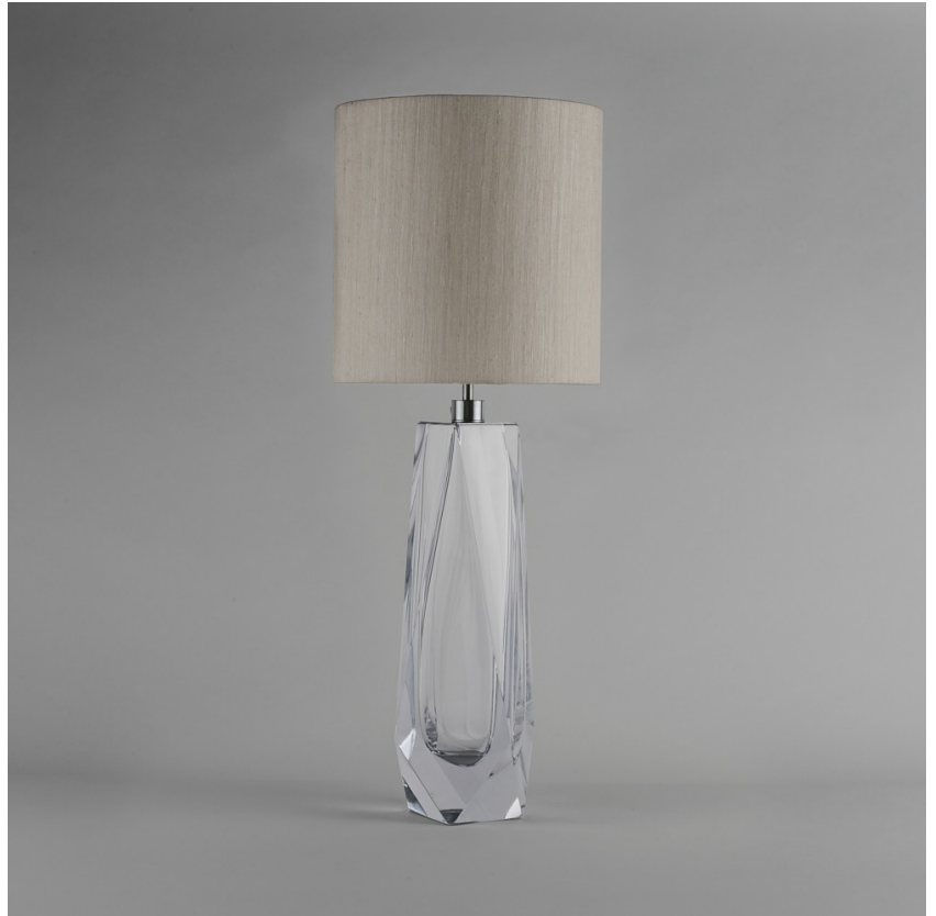
TL703-XL in Clear and Brushed Nickel with 13" Tall Drum in James Hare 31625-03 Blanched Almond