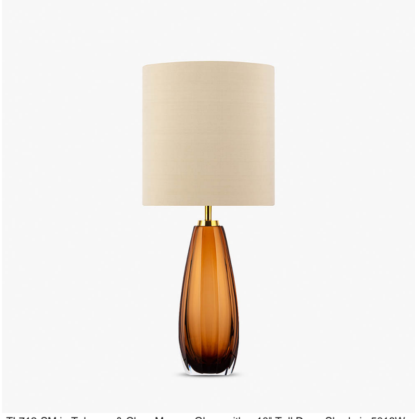
TL712-SM in Tobacco & Clear Murano Glass with a 10" Tall Drum Shade in 5018W-