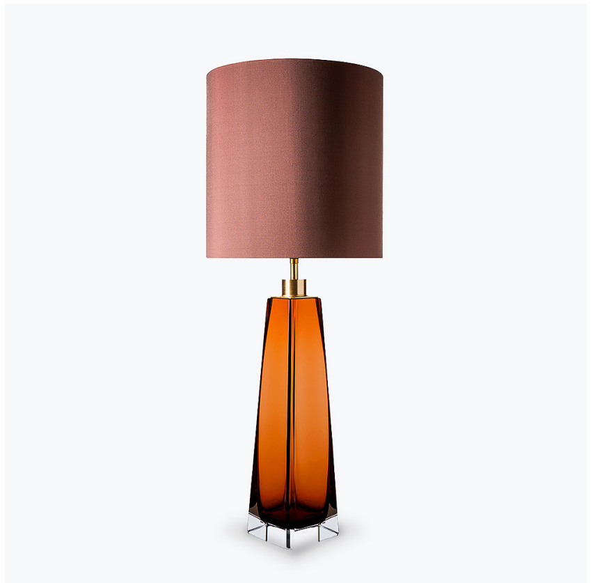
TL709 in Tobacco and Clear Glass and Brushed Gold with a 11