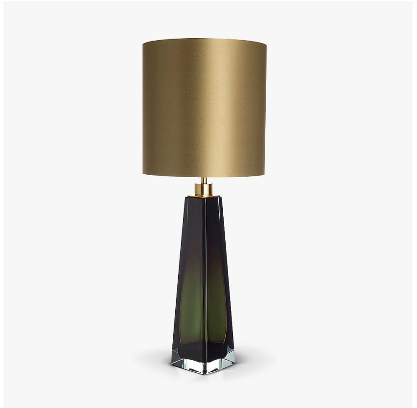
TL709 in Forest Green & Clear Murano Glass with Brushed Gold and 11 Inch Tall Drum Shade in 1806W/ Timber Wolf