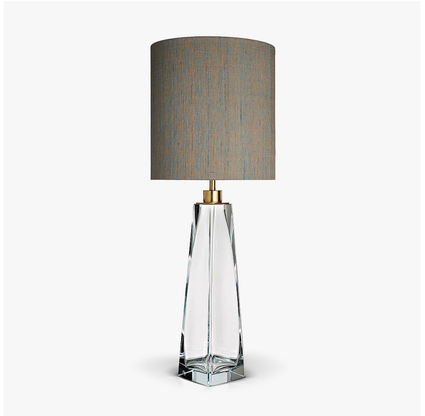
TL709 in Clear Glass and Brushed Gold with 11" Tall Drum Shade in Bennetts Silk Cochin