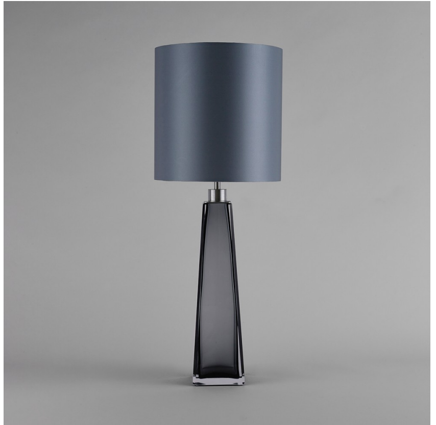
TL709 in Slate & Clear and Brushed Nickel with 11" Tall Drum in Bennett's 1806W-0312 Mist