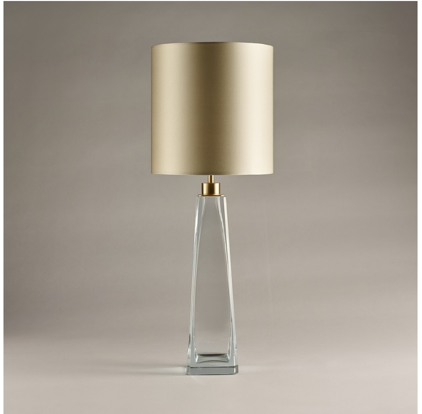
TL709 in Clear and Brushed Gold with 11" Tall Drum in Bennett's 1806W-4501 Platinum