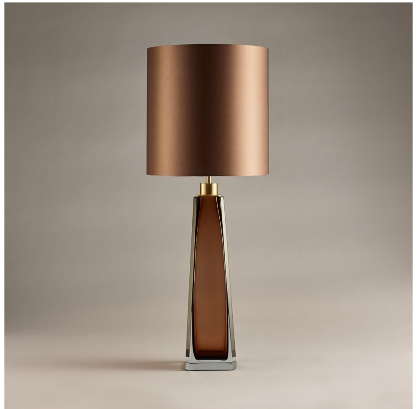
TL709 in Tobacco & Clear and Brushed Gold with 11" Tall Drum in Bennett's 1806W-326 Nutmeg