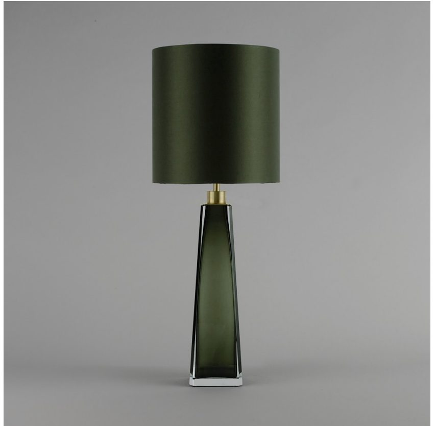
TL709 in Forest Green & Clear and Brushed Gold with 11" Tall Drum in Bennett's 1806W-120 Dill