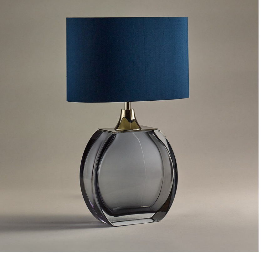
TL713-SM in Slate & Clear and Polished Nickel with 12" Oval in Bennett's 5018W-116 Nightingale

Recommended Shade(s) (OPTIONAL) 12" Oval