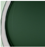
Forest Green & Clear (Solitaire)