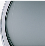
Slate & Clear (Solitaire)