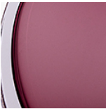
Amethyst & Clear (Solitaire)