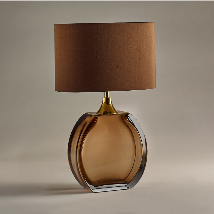
TL713-SM in Tobacco & Clear and Polished Gold with 12" Oval in Bennett's 5018W-126 Acacia Bark