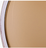
Tobacco & Clear (Solitaire)