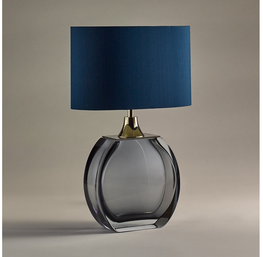
TL713-SM in Slate & Clear and Polished Nickel with 12" Oval in Bennett's 5018W-116 Nightingale