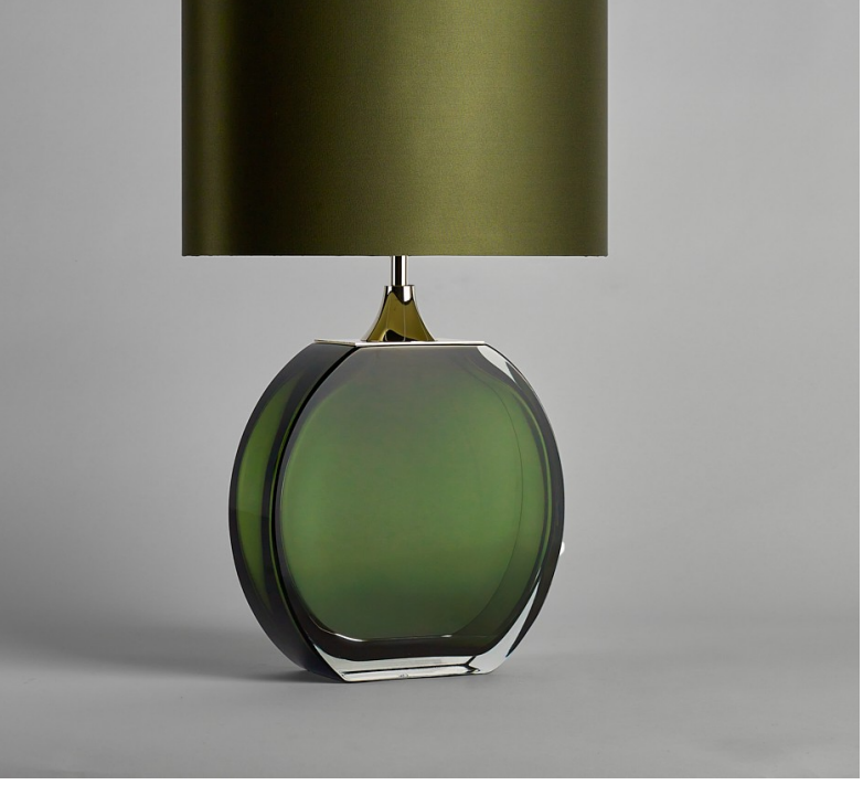
TL713-LA in Forest Green & Clear and Polished Nickel with 15" Oval in Bennett's 1806W-120 Dill

Recommended Shade(s) (OPTIONAL) 15" Oval