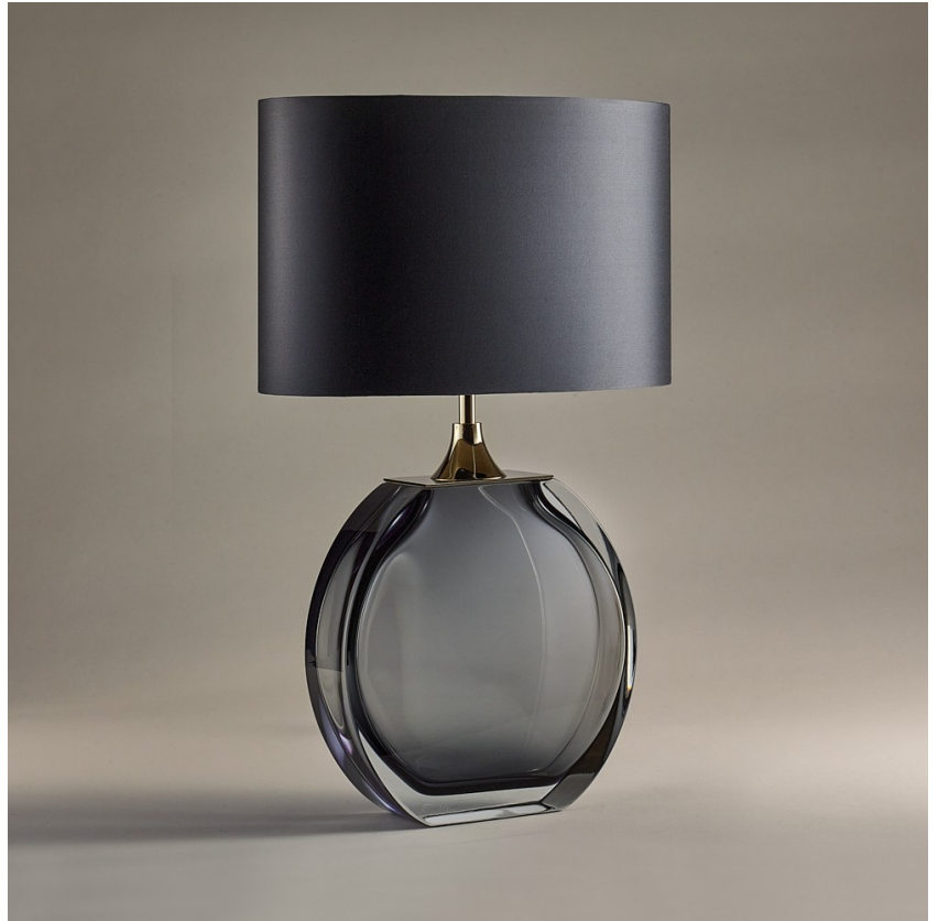
TL713-LA in Slate & Clear and Polished Nickel with 15" Oval in Bennett's 1806W-86 Prussian