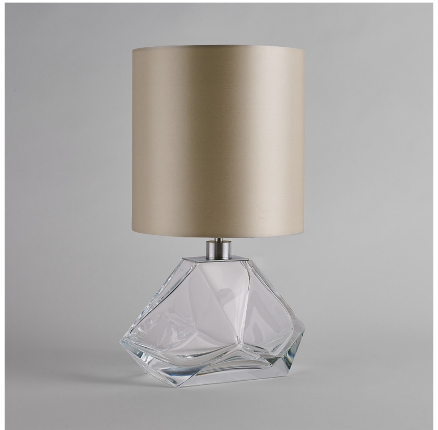
TL700 in Clear and Brushed Nickel with 11" Tall Drum in Bennett's 1806W-4501 Platinum