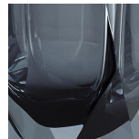
Slate & Clear