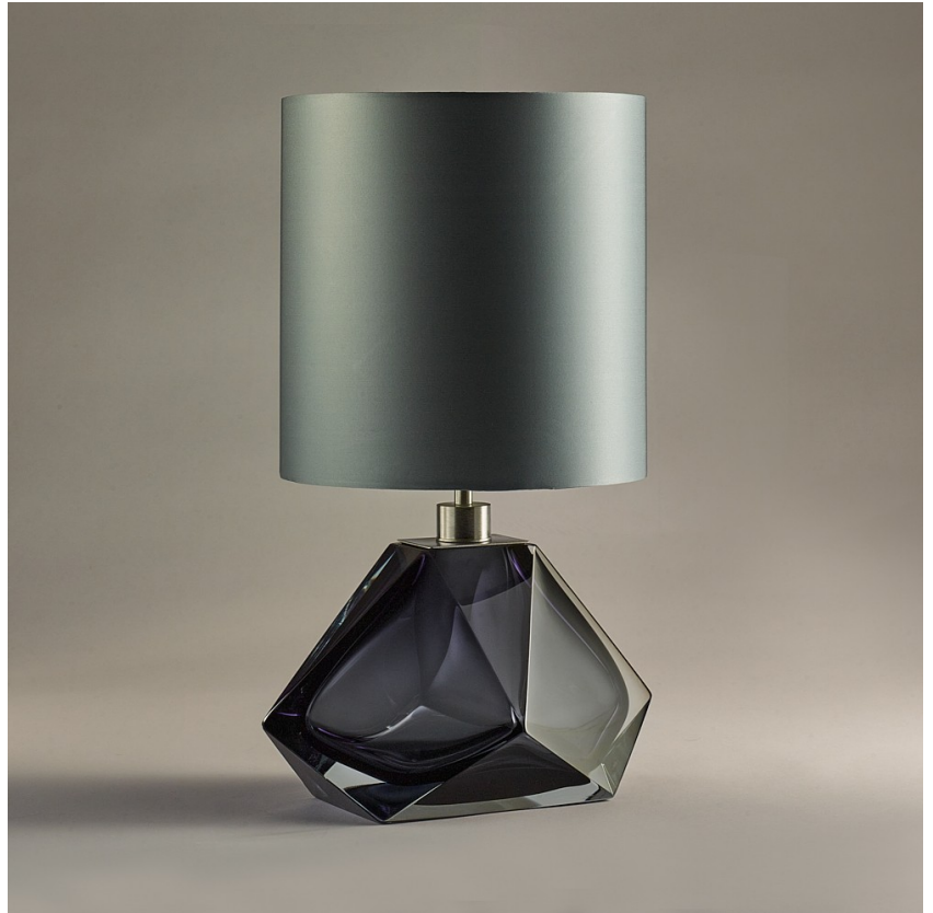
TL700 in Slate & Clear and Brushed Nickel with 11" Tall Drum in Bennett's 1806W-0312 Mist