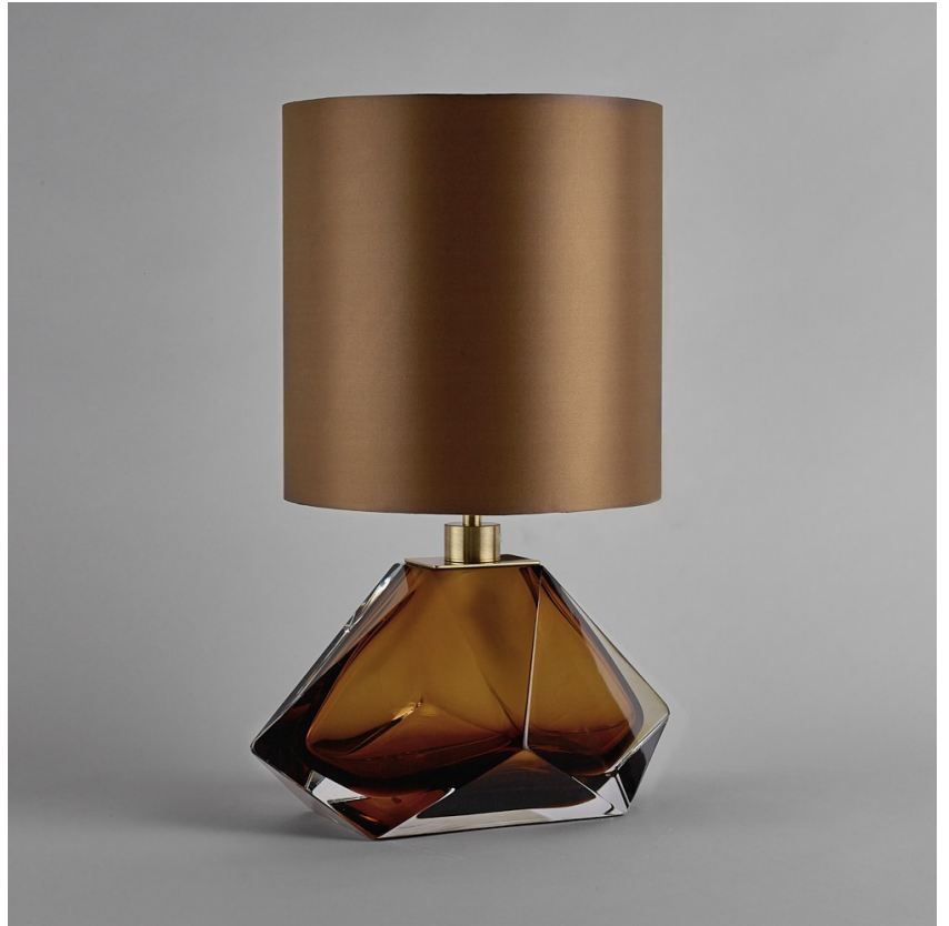
TL700 in Tobacco & Clear and Brushed Gold with 11" Tall Drum in Bennett's 1806W-326 Nutmeg