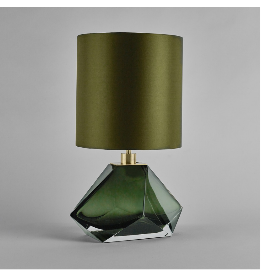
TL700 in Forest Green & Clear and Brushed Gold with 11" Tall Drum in Bennett's 1806W-120 Dill