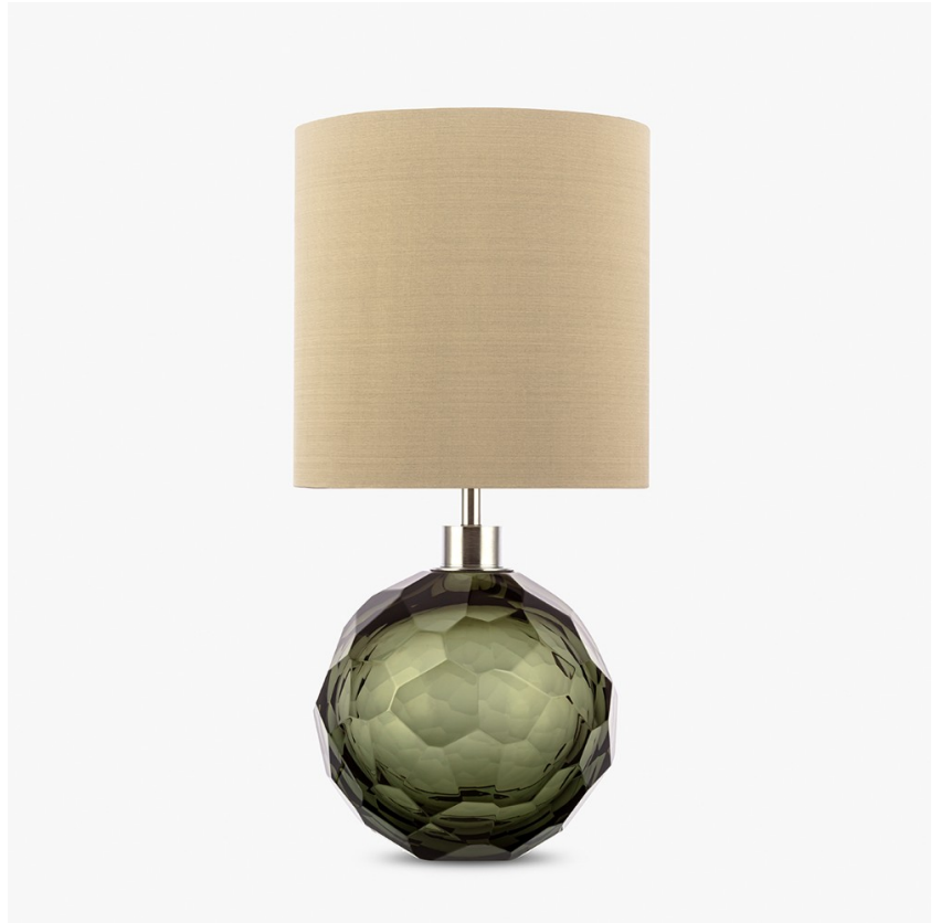
TL710-SM in Forest Green & Clear and Brushed Nickel with a 9" Tall Drum Shade in Bennett Silks Dupion Silk 5018W-1094 Bronze