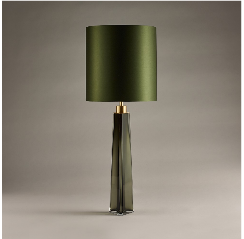
TL708 in Forest Green & Clear and Brushed Gold with 11" Tall Drum in Bennett's 1806W-120 Dill