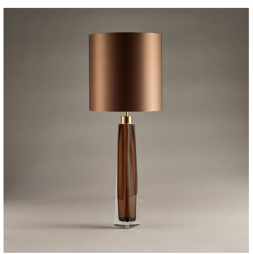
TL708 in Tobacco & Clear and Brushed Gold with 11" Tall Drum in Bennett's 1806W-326 Nutmeg