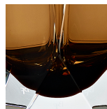
Tobacco & Clear