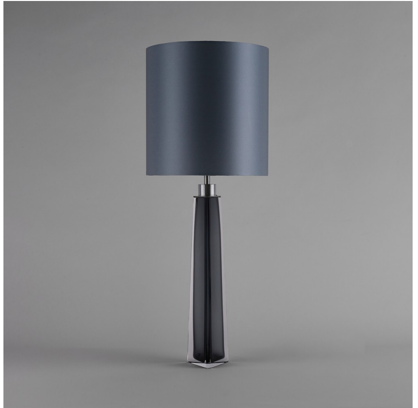
TL708 in Slate & Clear and Brushed Nickel with 11" Tall Drum in Bennett's 1806W-0312 Mist