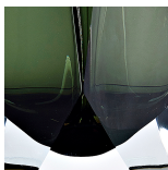
Forest Green & Clear