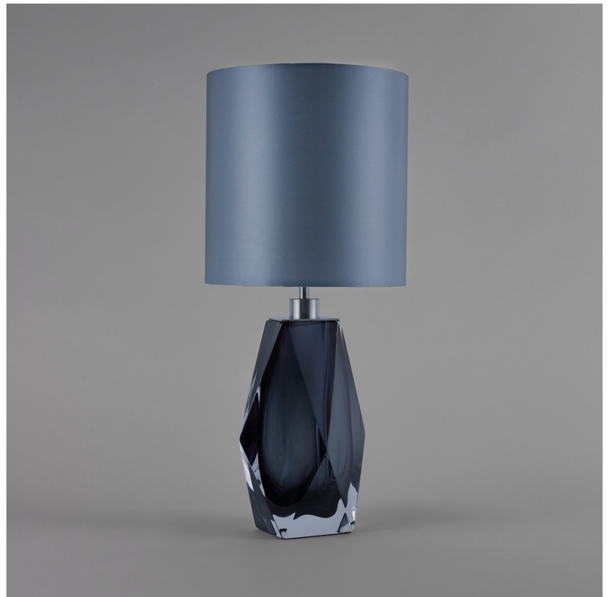
TL701 in Slate & Clear and Brushed Nickel with 11" Tall Drum in Bennett's 1806W-0312 Mist