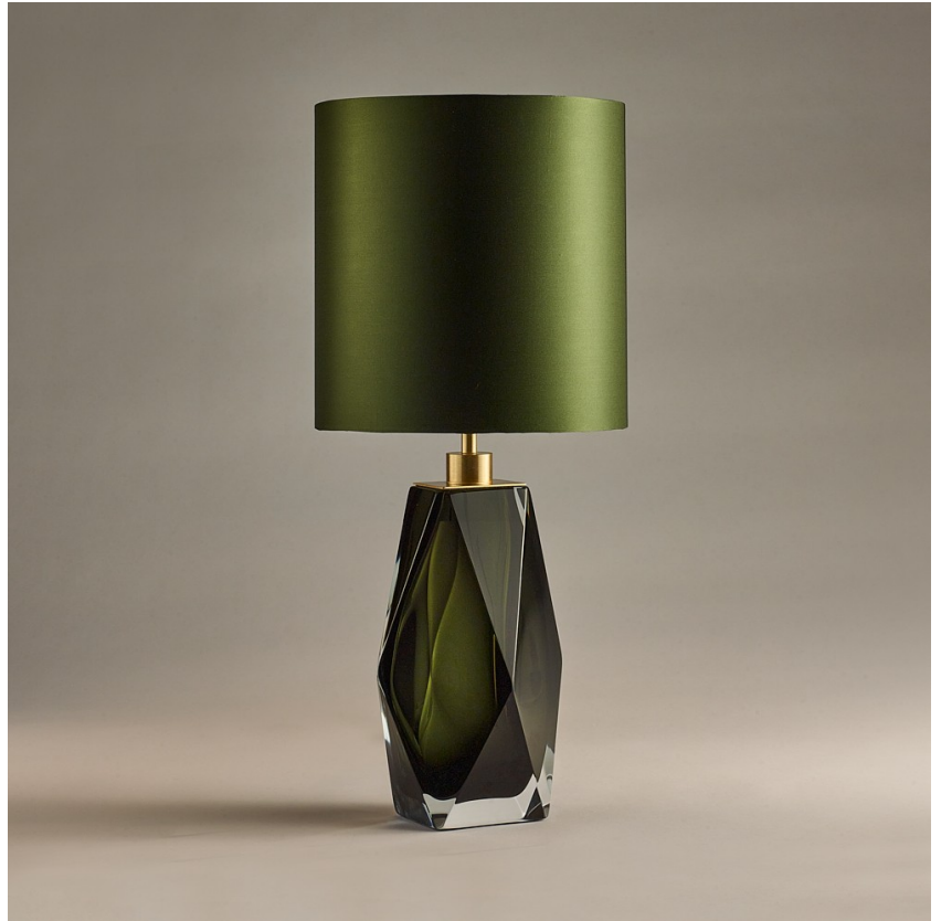
TL701 in Forest Green & Clear and Brushed Gold with 11" Tall Drum in Bennett's 1806W-120 Dill