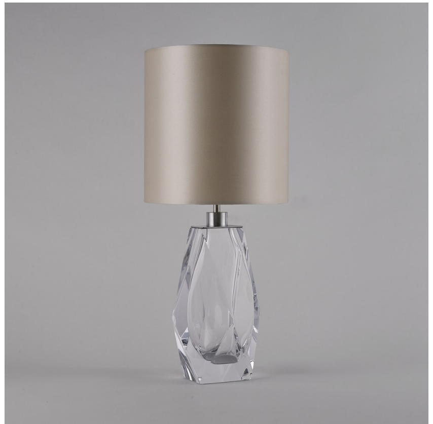
TL701 in Clear and Brushed Nickel with 11" Tall Drum in Bennett's 1806W-4501 Platinum