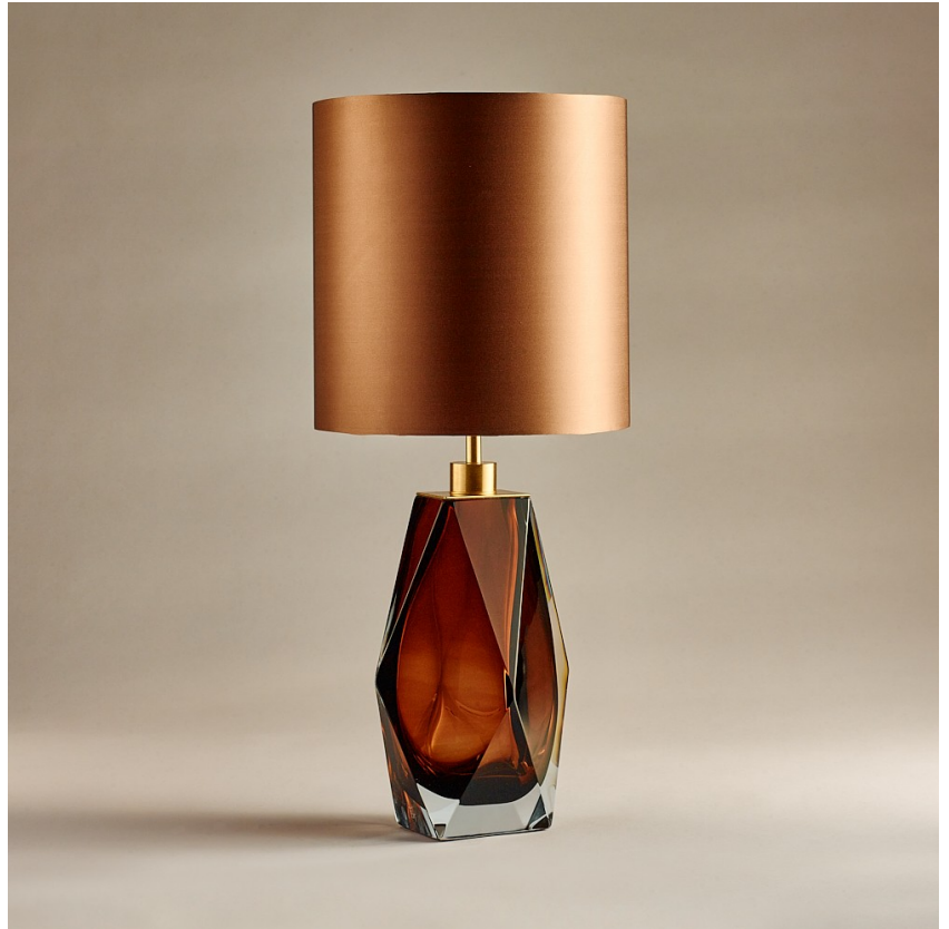
TL701 in Tobacco & Clear and Brushed Gold with 11" Tall Drum in Bennett's 1806W-326 Nutmeg