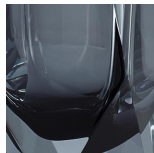
Slate & Clear