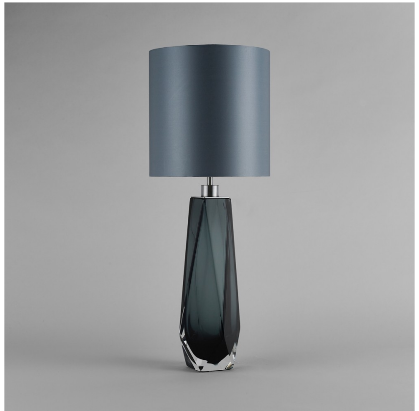
TL702 in Slate & Clear and Brushed Nickel with 11" Tall Drum in Bennett's 1806W-0312 Mist