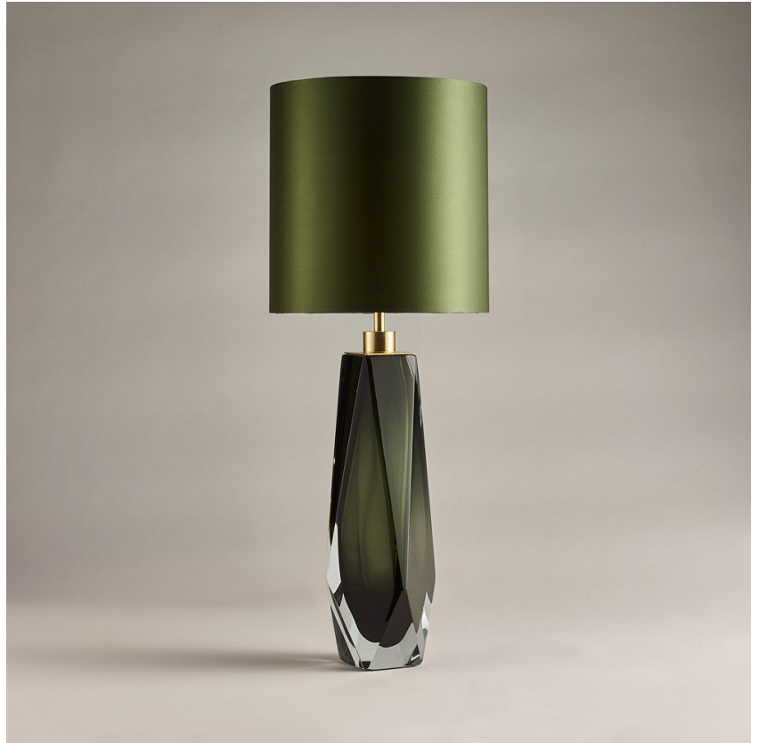
TL702 in Forest Green & Clear and Brushed Gold with 11" Tall Drum in Bennett's 1806W-120 Dill