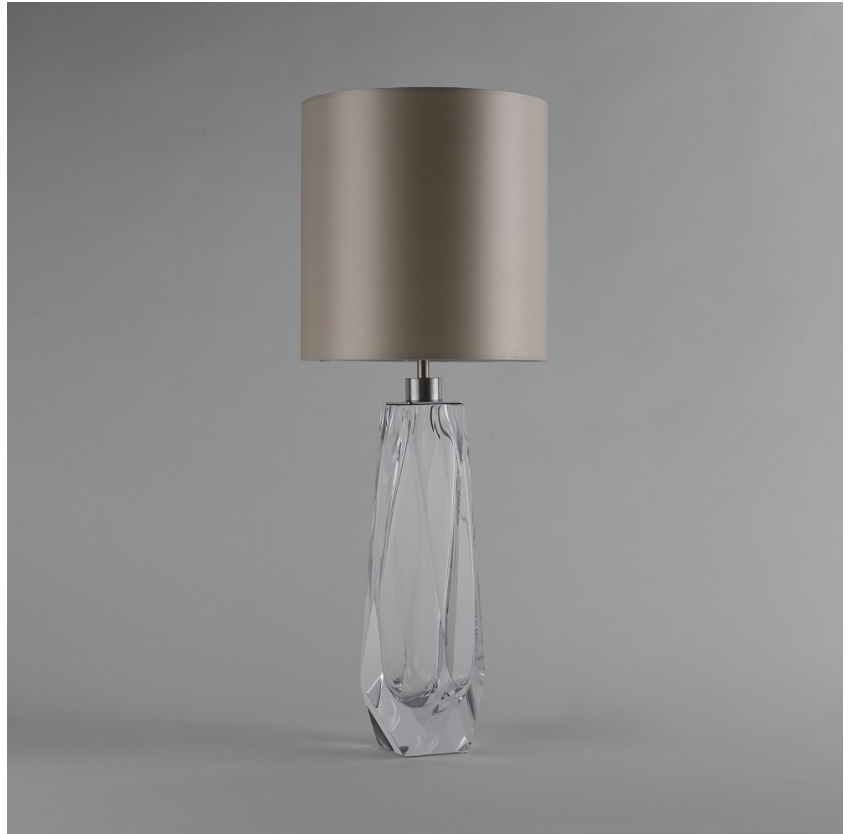
TL702 in Clear and Brushed Nickel with 11" Tall Drum in Bennett's 1806W-4501 Platinum