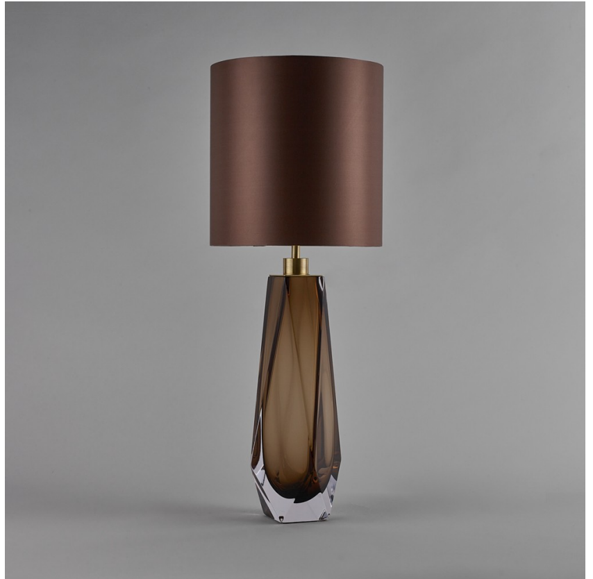
TL702 in Tobacco & Clear and Brushed Gold with 11" Tall Drum in Bennett's 1806W-326 Nutmeg