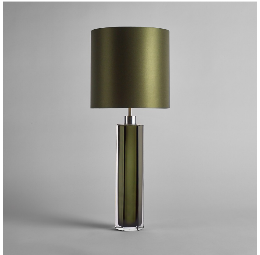
TL704-SM in Forest Green & Clear and Brushed Nickel with 10" Tall Drum in Bennett's 1806W-120 Dill