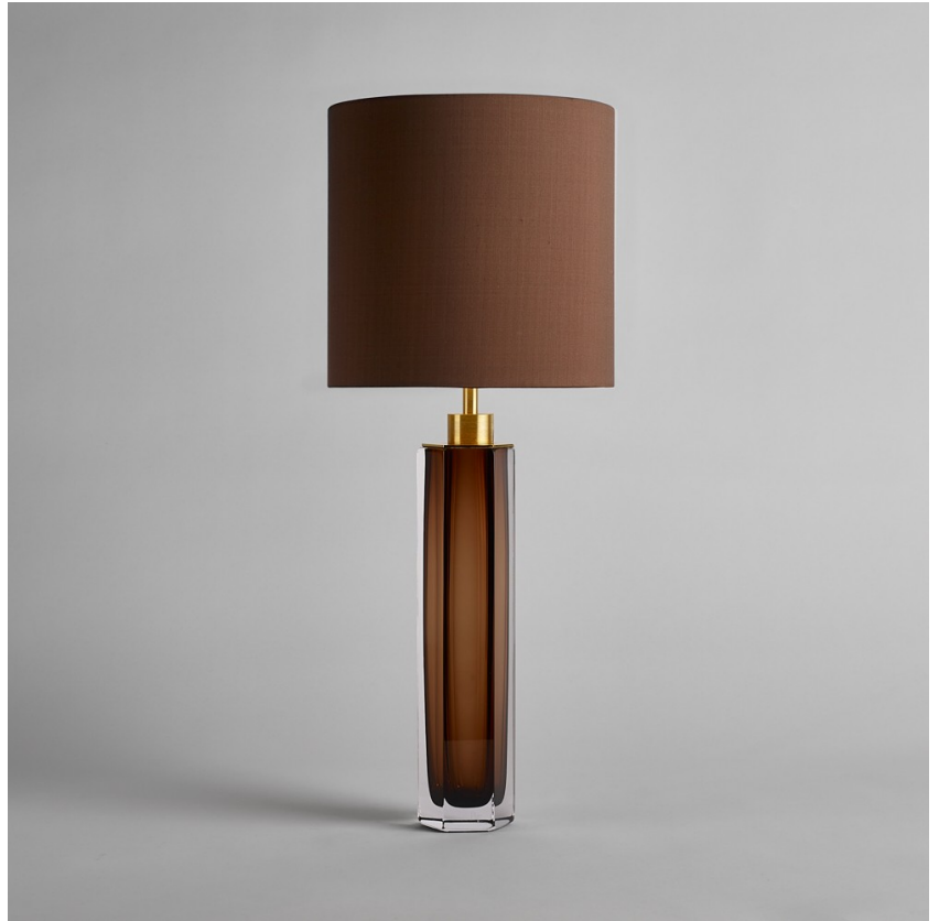
TL704-SM in Tobacco & Clear and Brushed Gold with 10" Tall Drum in Bennett's 5018W-126 Acacia Bark