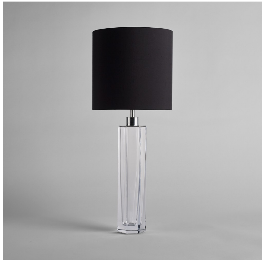
TL704-SM in Clear and Brushed Nickel with 10" Tall Drum in Bennett's 5018W-52 Black Dupion