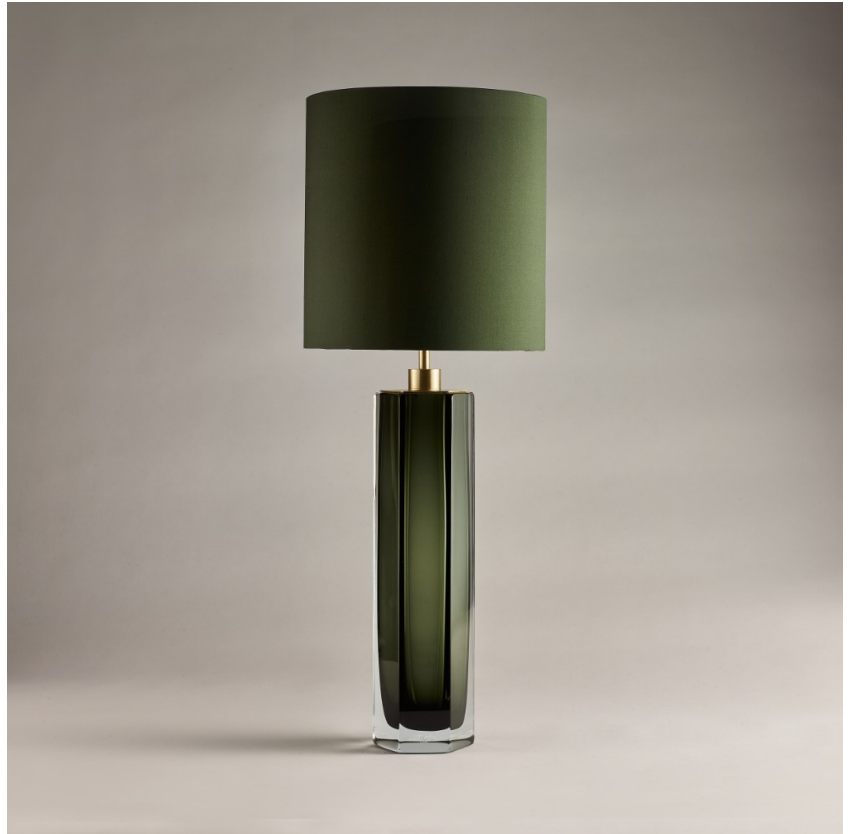
TL704-LA in Forest Green & Clear with Brushed Gold and 12" Tall Drum in Bennett's 5018W-120 Dill