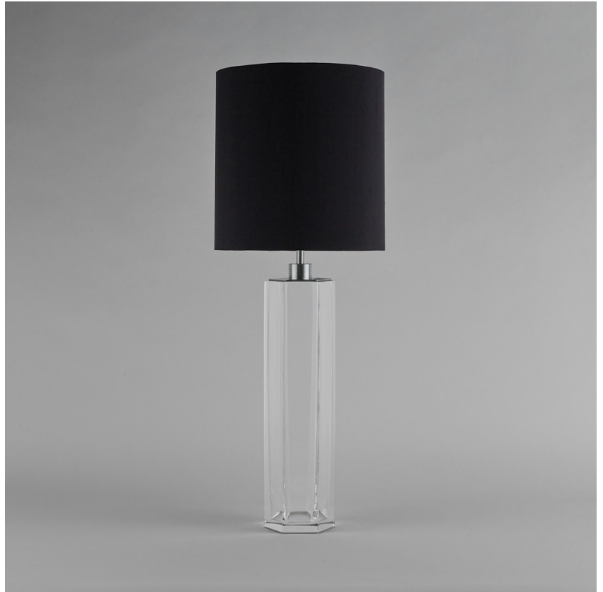
TL704-LA in Clear with Brushed Nickel and 12" Tall Drum in Bennett's 5018W-52 Black Dupion