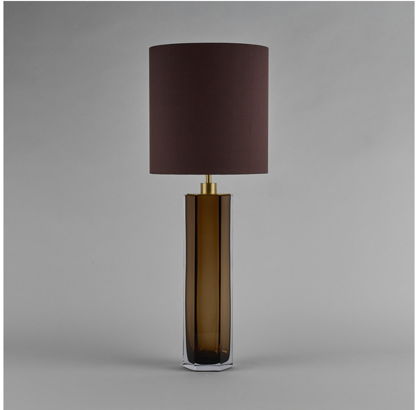
TL704-LA in Tobacco & Clear with Brushed Gold and 12" Tall Drum in Bennett's 5018W-127 Raisin