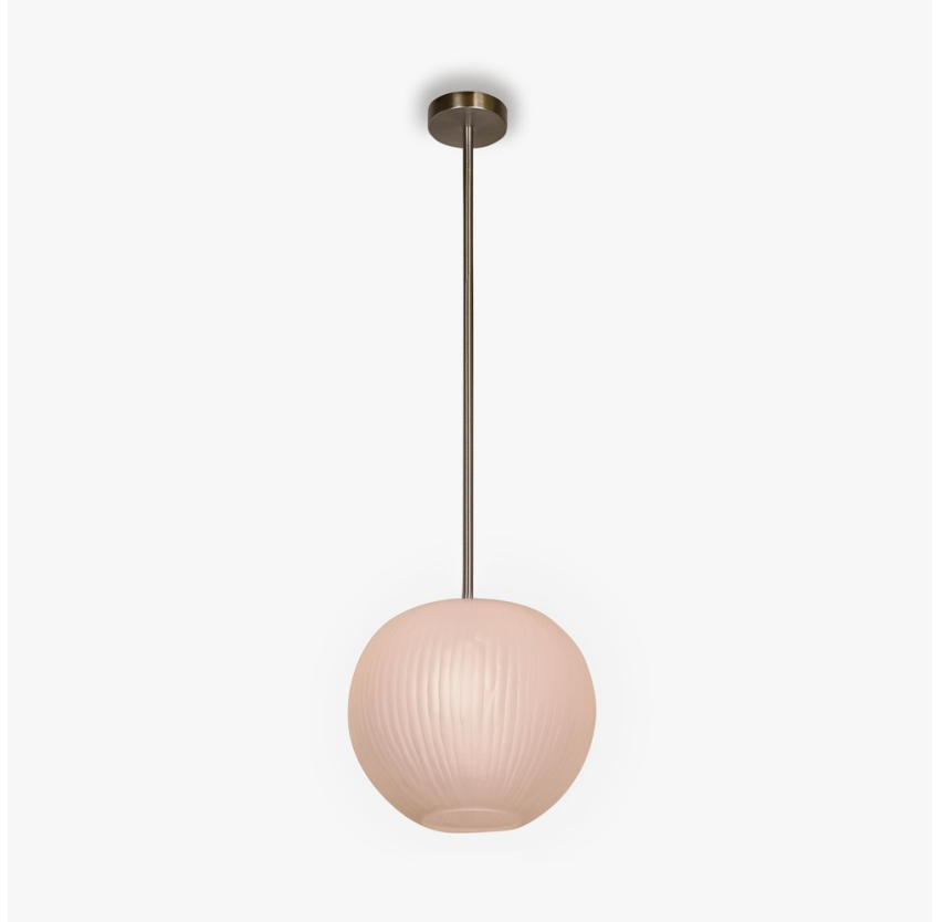
CL236-PEN in Blush and Brushed Nickel