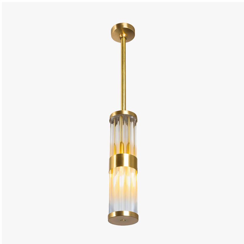
CL121-PEN-12 in Clear Lucite and Brushed Gold

Modelled on our iconic Curzon Street chandelier the new Curzon Street pendant is a welcome addition to the range. With its long, slender design this would look elegant and chic in any given interior. Available in either clear or frosted Lucite and a number of sizes.