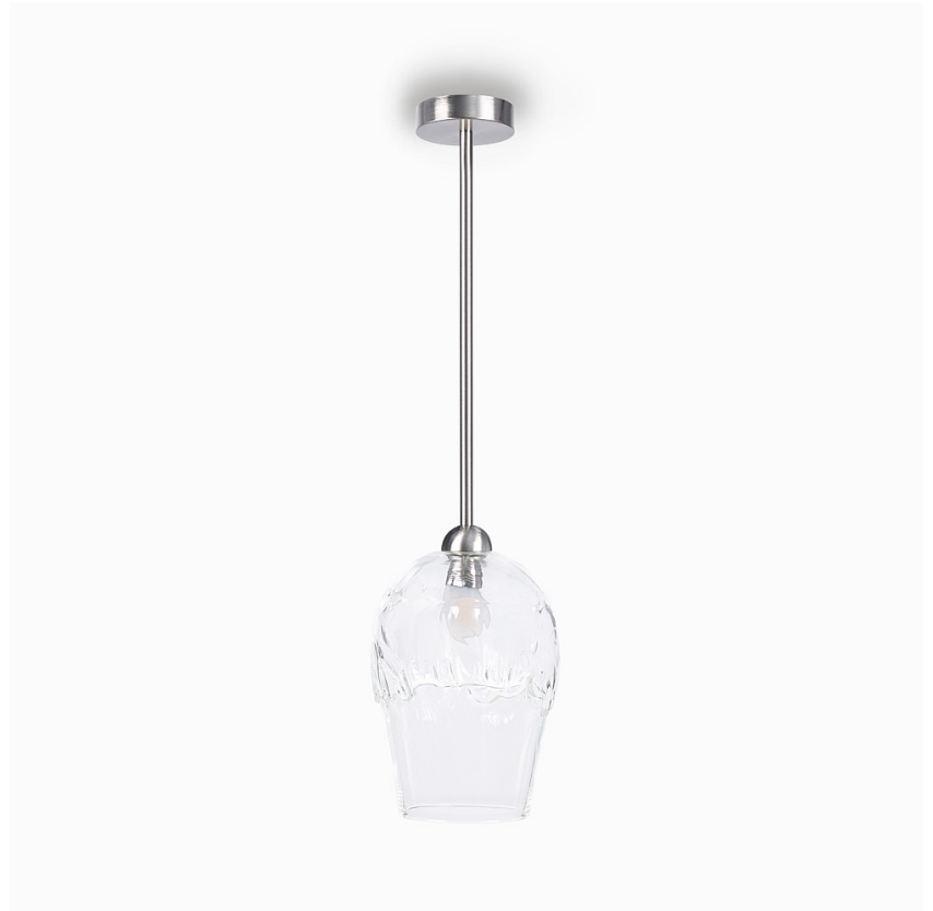
CL238 in Clear and Brushed Nickel