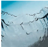
Crest Ocean Blue