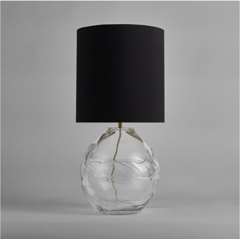
TL238 in Clear and Brushed Gold with 12" Tall Drum in Bennett's 5018W-52 Black Dupion