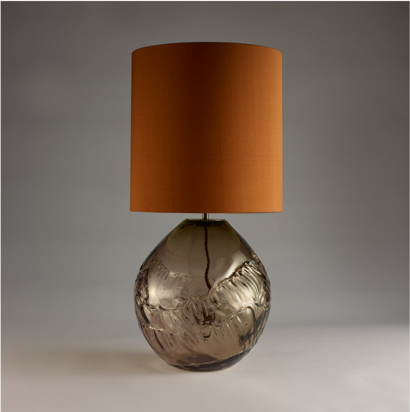
TL238 in Bronze and Brushed Bronze with 12" Tall Drum in Bennett's 5018W-2029 Aztec