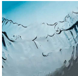
Crest Ocean Blue