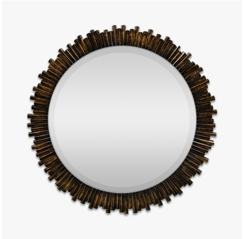
Concertina Random Mirror in Distressed Bronze

A more contemporary piece designed in a distressed bronze finish from the brutalist era of the 1970s. Encompassing the glass is a multitude of brass v-shaped strips welded together to create a subtle lighting effect.