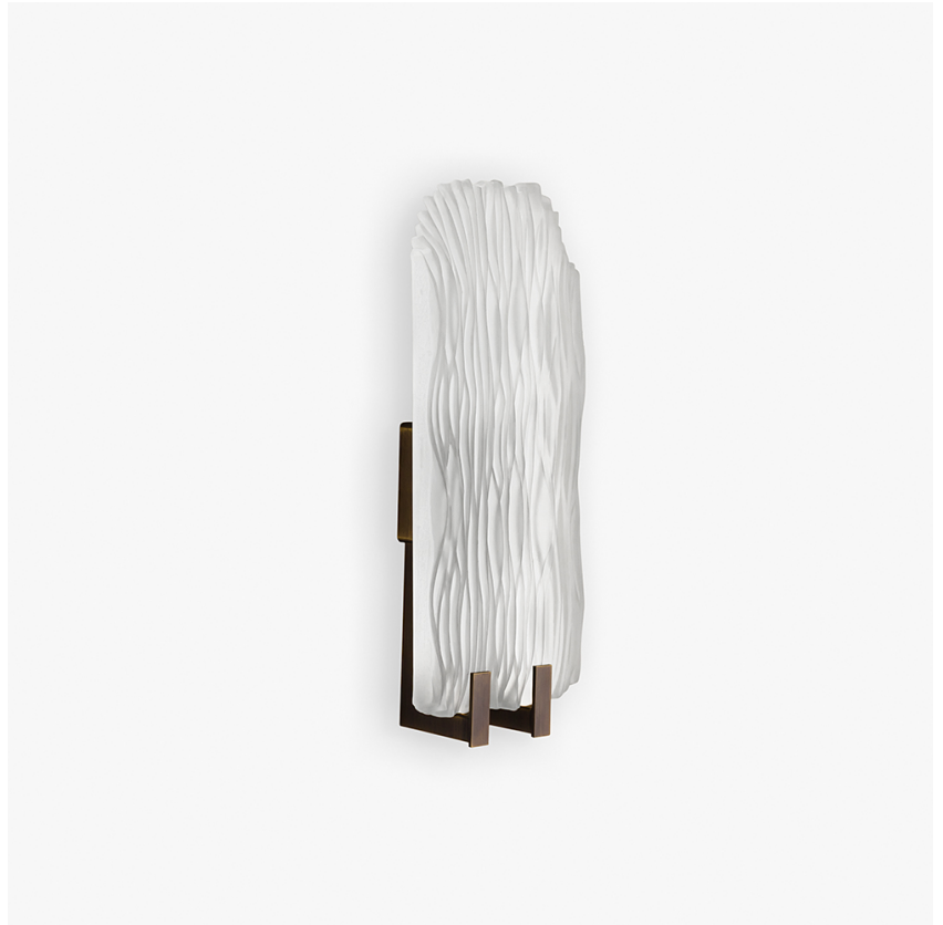
WL211-RECT in satin glass and brushed dark bronze