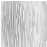
Clair de Lune Satin