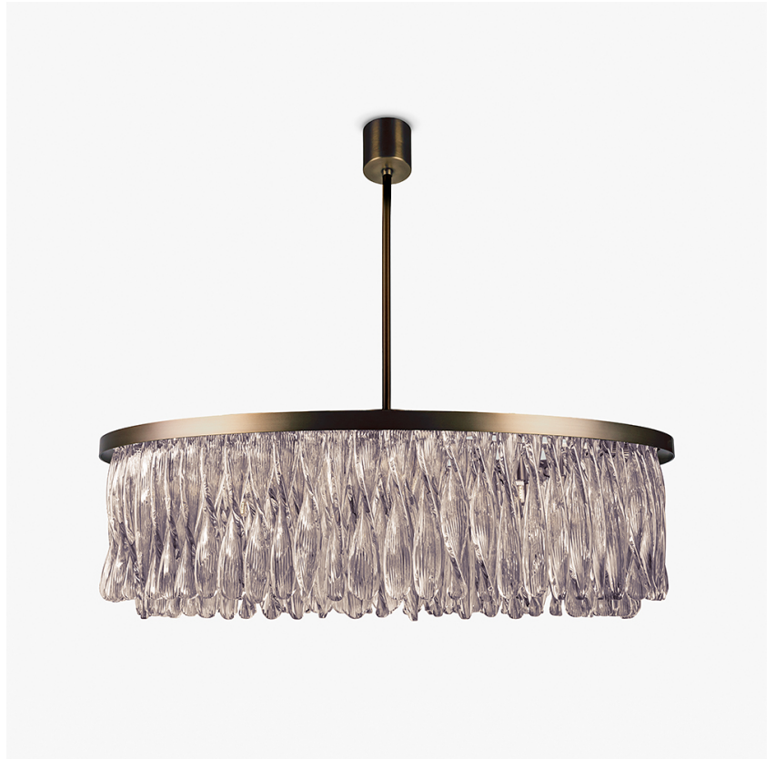
CL464-3T-100 in Clear and Smoke and Brushed Bronze