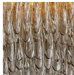
Clear & Smoke Ribbon