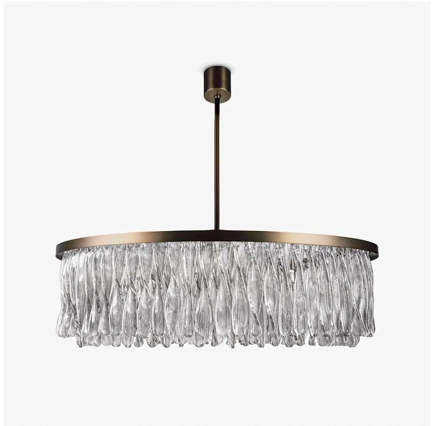
CL464-3T-100 in Clear and Brushed Bronze